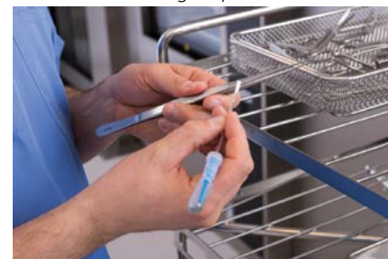
Checking for protein